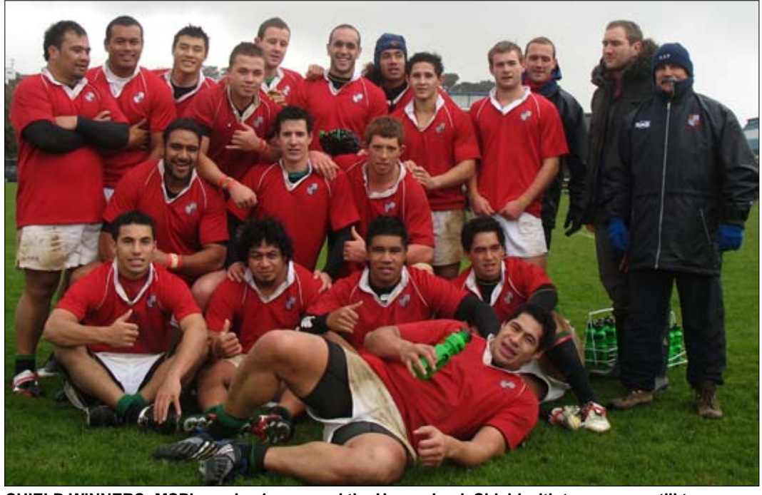
SHIELD WINNERS: MSP's senior 1s secured the Harper Lock Shield with two games still to go.